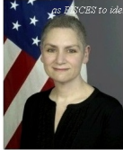
Acting Assistant Secretary for Political-Military Affairs Term of Appointment: 02/22/2016 to present

« Balancing border security through terrorist travel interdiction is another priority. The Terrorist Interdiction Program provides 22 partner countries with the Personal Identification Secure Comparison and Evaluation System known as PISCES to identify, disrupt, and deter terrorist travel. »