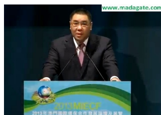
Mister Chui Sai On, lors de son discours d'ouverture officielle